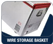
WIRE STORAGE BASKET