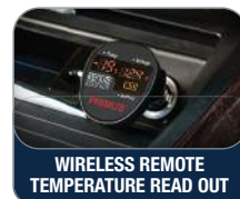
WIRELESS REMOTE TEMPERATURE READ OUT